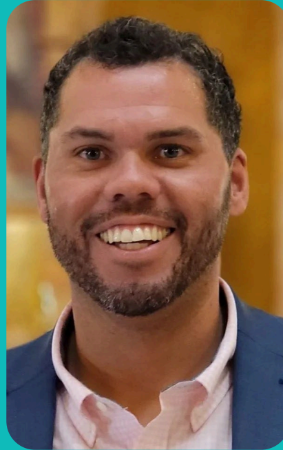
Birth Defects Program Section Chief